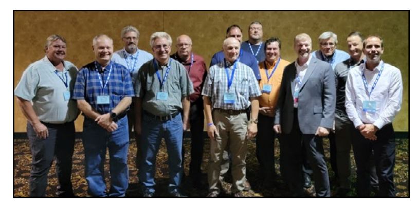
Electrical area representatives and staff at the IAEI Western Section meeting.

The Western Section is the largest of six IAEI sections, and includes 17 states across the center United States. Minnesota's electrical area representatives have been very active in the 2023 NEC code making process and submitted many proposals that were accepted by the code panels.