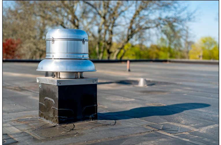
Example of curb elevated for future insulation.

The intent of this amendment is to address energy loss through curbs that have either low levels of insulation, or in most cases, no insulation at all. Curbs are made of metal and are highly conductive when not insulated. If the curb does not get insulated, it continues to be a thermal bridge and conduit of energy loss between the interior and exterior of the building.