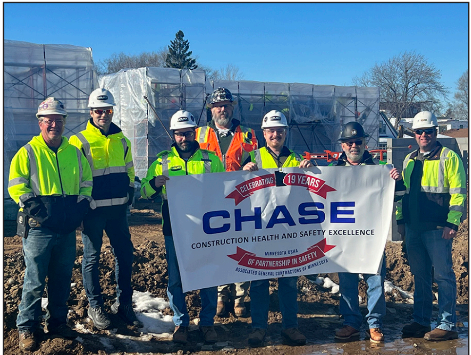
LS Black Constructors • Canvas Apartments • Minneapolis