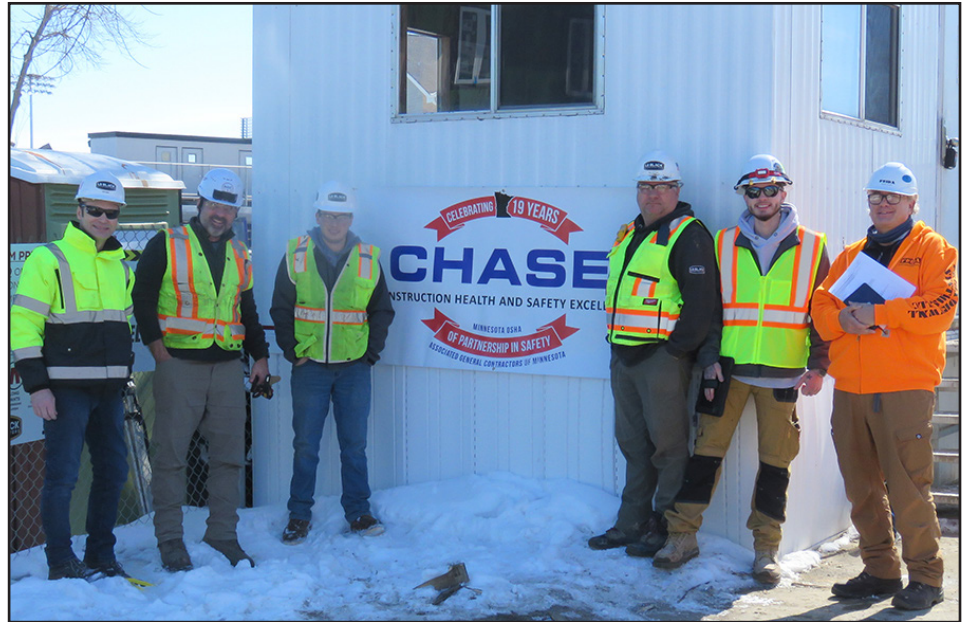
LS Black Constructors • Crown College • St. Bonifacius, Minnesota